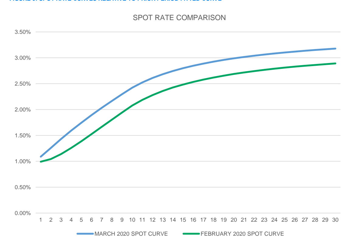
FIGURE 9: SPOT RATE CURVES RELATIVE TO PRIOR PERIOD FITTED CURVE

Figure 9 shows the resulting spot rate curve of one to 30 years relative to the prior period fitted curve.