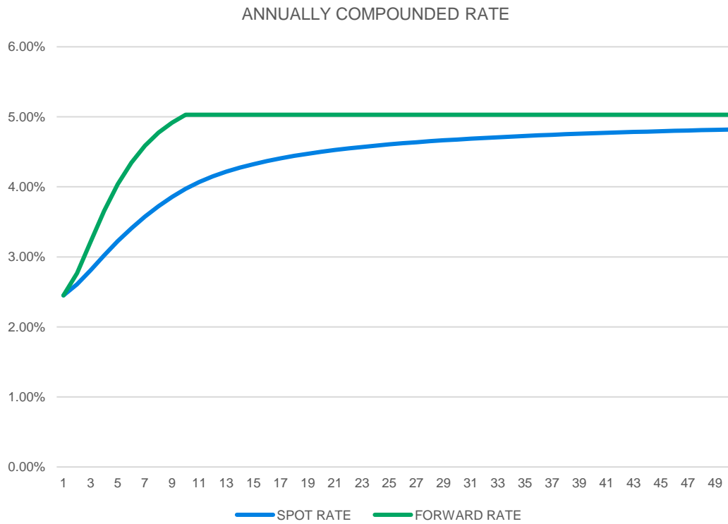
FIGURE 7: SPOT AND FORWARD RATE CURVES FOR ASSET CALIBRATION SET USING AN MLES INTERPOLATION AND CONSTANT FORWARD RATE EXTRAPOLATION METHOD

Figures 7 and 8 show the resulting spot and forward yield curves of one to 50 years for the calibration set using the MLES method and extrapolated with the constant forward rate extrapolation method. Spot rates shown are quoted as annually compounded rates on zero coupon bonds with maturities of the specified term, forward rates shown are 1-year forward rates ending at the specified term.